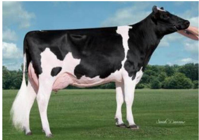
MGGD: Quality Tango Paris

Sire: Claynook Zasberilla Dam: Siemers Lmda Paris 27856-ET EX-91 03-05 2x 365d 38580m 4.1 1579f 3.5 1362p MGS: Farnear Delta-Lambda-ET TL TV TD MGD: Siemers Denver Paris-ET EX-91 MGGS: Mr Mogul Denver 1426-ET TL TD TV MGGD: Quality Tango Paris VG-86 01-11 2x 365d 32500m 4.9 1594f 3.4 1094p